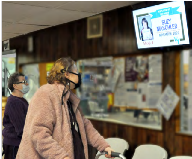
Employees at Vocational Services, Inc., in Liberty and North Kansas City can learn about everything from properly wearing a mask to recently honored coworkers with VSI TV, a network of screens that “broadcast” information at all three locations.

This year that became critical as employees came back from quarantines with