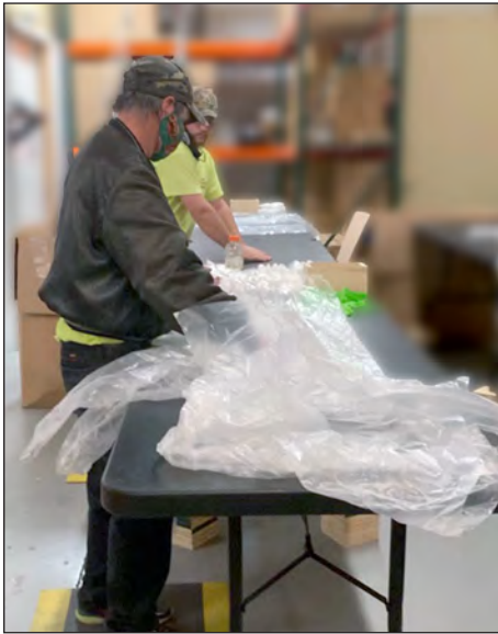
Employees at Laclede Industries in Lebanon were among those at four workshops helping a furniture manufacturer fulfill an emergency request for COVID-related PPE.

Four Missouri workshops played a critical role helping a Lebanon, Mo. furniture manufacturer produce 150,000