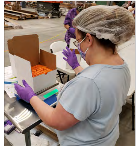
Employees at Southeast Enterprises were part of an intense effort to design and manufacture COVID testing supplies

Southeast Enterprises continues to prospect new clients. The opportunities included making, inspecting and reworking packaging materials, assembly and