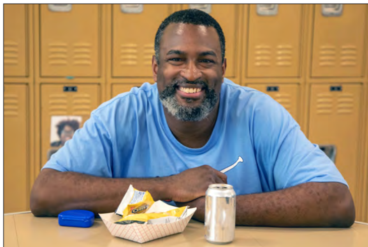
One of the 5,400 citizens working in Missouri workshops.

All people have a more fulfilling life if they are working. In Missouri, sheltered workshops provide MOre employment options for those otherwise who would not be working. Thanks for your support!